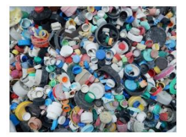
Bottlecaps gathered from the oceans