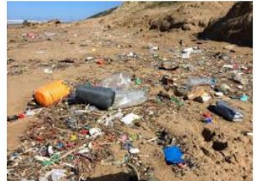
Tangle of floating plastic netting and other plastic debris Polluted beach

Explore the problem - How does plastic effect marine life eg. turtles?