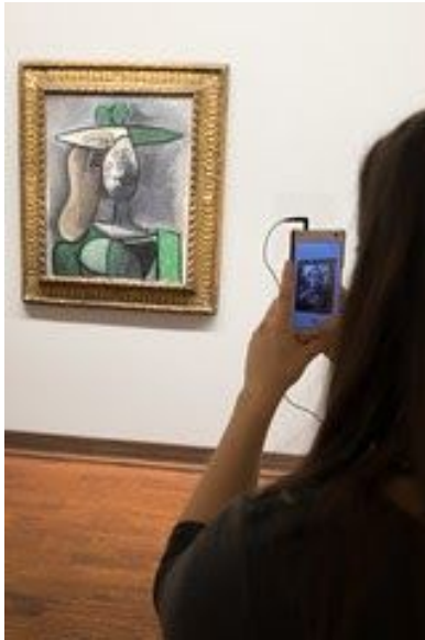
of a person using Artivive.